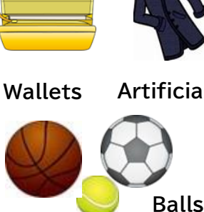
Artificial leather Shoes, Sandal